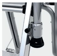
Evolution of guardrail locking system