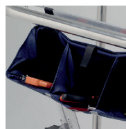
Large capacity, removable fabric tool holder