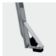
Wide fixed feet for the 3 and 4-step models