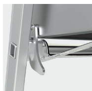
Rear anti-lift locks