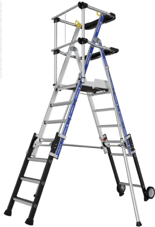
Sherpascopic braces guardrail 5/7 steps

NF certified product. Certifying body: AFNOR Certification, 11, rue Francis de Pressensé, F-93571 La Plaine Saint Denis Cedex (FR). Certification reference: Construction site equipment NF (NF096) available at www.marque-nf.com . A NF-certified individual mobile platform (or lightweight individual mobile platform) must be used with all the components listed in the model's nomenclature.