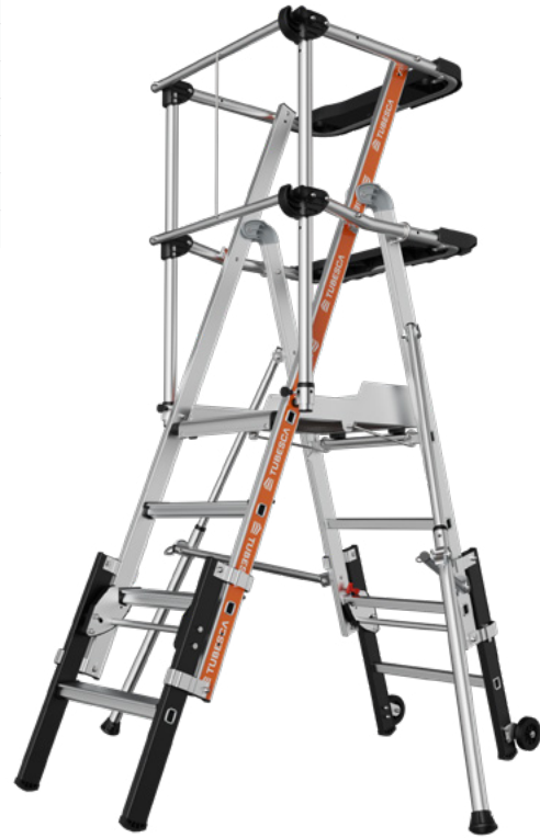
Raptorscopic braces guardrail - 3/4 steps