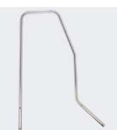
Handrail kit (x1) ref. 02379814