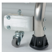
Optional retractable wheels in work position ref. 02379813