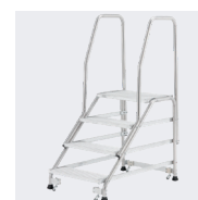
Model with 2 handrails and 1 wheels kit

Optional handrail: 02379814 - Optional wheels: 02379813.