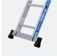
Wide base for increased stability