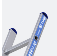
Ribbed end-piece for increased stability