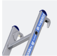
Models with hooks