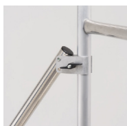
The ends of the horizontal tubes and diagonals have toothed jaws that automatically position themselves around the rungs. A highly dependable system