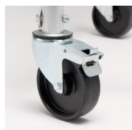
The wheels are fitted with powerful brakes that contributes to holding the unit perfectly stable when in working position