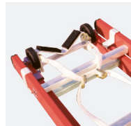
Optional cradle for use on posts Ref. 9224