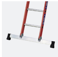
Wide base for increased stability