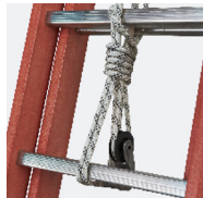
UV-protected rope for resisting against the sun and bad weather