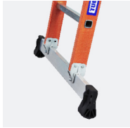
Wide base for increased stability