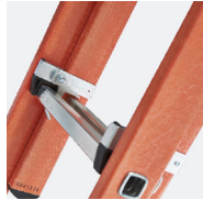
Sliding section locking system