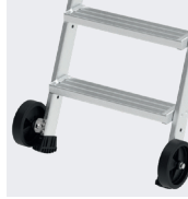
Wheels for ease of movement