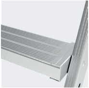
Non-slip steps 80 mm