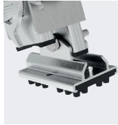
Non-slip swivelling skids to adapt to all situations